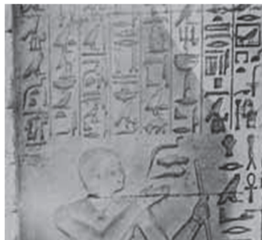
Fig. 1.3. Egyptian hieroglyphs: like this one, show medical procedures.

Their pharmacists prepared prescriptions of ointments, lotions, inhalers and pills by processing plant materials that were used to treat specific illnesses. Records show that they used many preparations including opium, cannabis, linseed oil and senna. Many modern drugs have originated from the study and isolation of active ingredients from plants with healing properties.