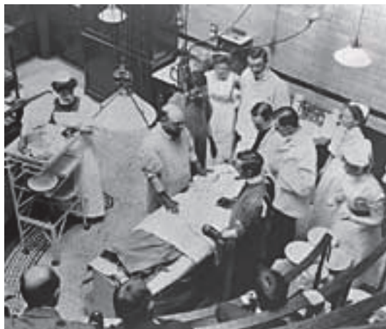
Fig. 1.7. Operating theatres: In 1900 were not the sterile environments

The industrial revolution of the eighteenth and nineteenth centuries saw a massive change in the way, people lived and how this affected their health. People moved from small villages and an agricultural lifestyle to live in towns and cities that sprang up around the new factories, where they could work. People lived in dirty, overcrowded conditions with poor sanitation and dirty drinking water. Many died from diseases such as cholera, tuberculosis, measles and