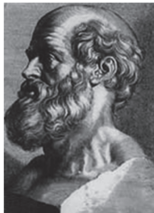
Fig. 1.4. Hippocrates: famed for the Hippocratic oath

The Romans realised that there was a link between dirt and disease. To improve public health, they built aqueducts to supply clean drinking water and sewers to remove wastes safely. Improved personal hygiene helped to reduce disease and Roman baths were places to socialise as well as stay clean.