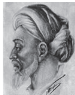
Fig. 1.6. The Arab Physician and scholar Ibn Sina (or Avicenna). Wellcome Library, London