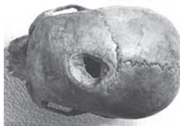
Fig. 1.2. Trepanning: an ancient human skull viewed from above. Note the large hole

Cave paintings and symbolic artefacts found by archaeologists suggest the earliest humans believed in spirits and supernatural forces. One form of primitive surgery seems quite shocking. Ancient skulls have been found with a hole bored into them. This appears to have been a deliberate operation and carried out whilst the person was still alive. We can only speculate as to the reason for this operation, called trepanning, but it may have been to allow the evil spirits to leave a sick person.