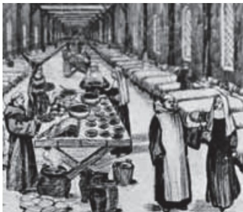
Fig. 1.5. A medieval hospital: Patients were given food and cared for by monks and nuns.

Records show that Arabic doctors performed many different surgical operations including the removal of varicose veins, kidney stones and the replacement of dislocated limbs.